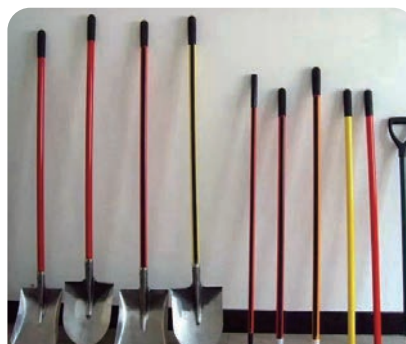
FRP Round Tube Tool Handles