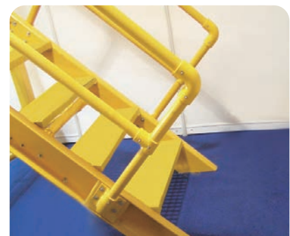
FRP Round Tube Handrail