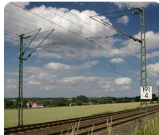
FRP round rod railway overhead contact line