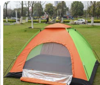
FRP round rod tent support