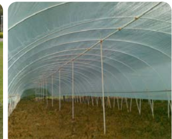
FRP round rod green house frame