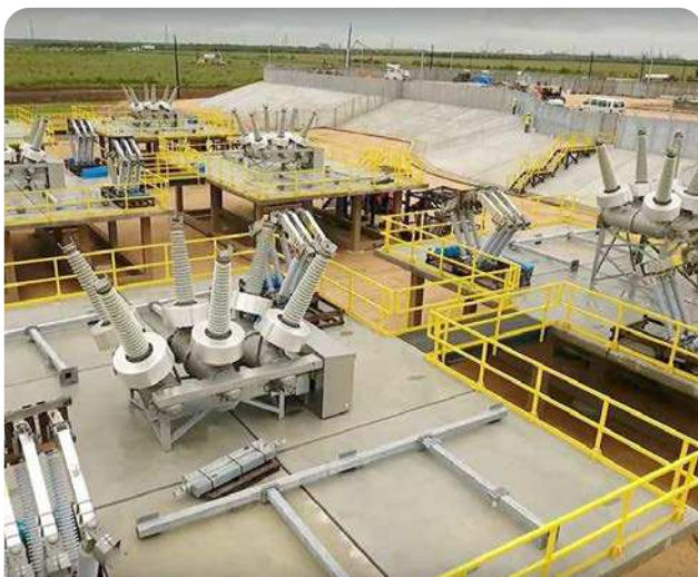
Electrical Power Engineering