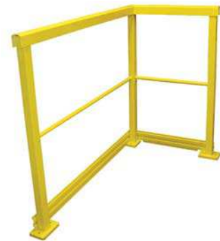
Channel Top FRP Handrail