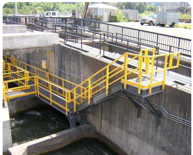
Water And Waste Water Treatment