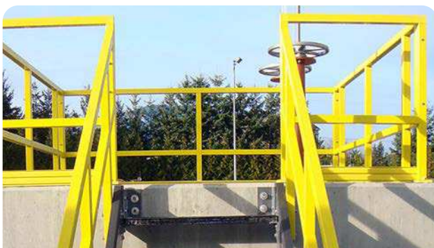
FRP Round Handrail Fittings