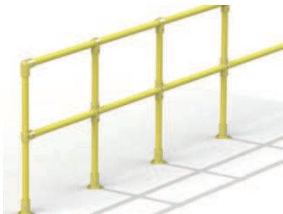
FRP All Round Tubes Handrail