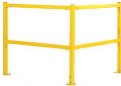
FRP All Square Tubes Handrail