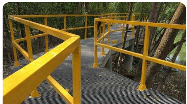
FRP Square Handrail Fittings