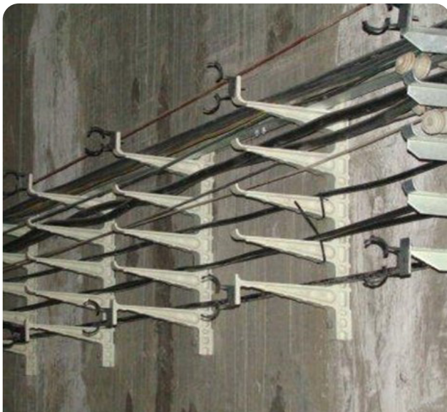
FRP cable bracket in cable tunnels