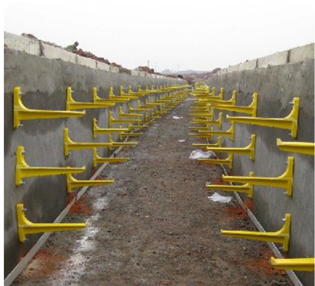
FRP cable bracket in cable trenches